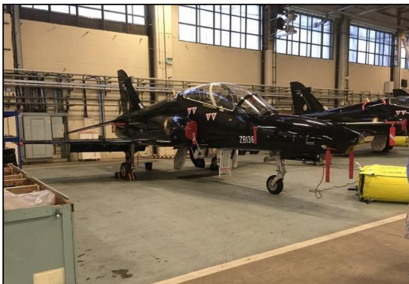
BAE Hawk T2-167 of No 11 Sqn.