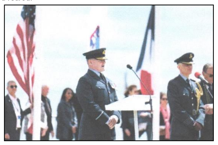
Air Commodore Jamie Thompson giving his address.

the National Guard led the US contingent which included the standard of the 29th Infantry and an honour guard supported by the Divisional band. Although overcast initially the clouds cleared and allowed the Sun to shine down. The event opened with a flypast by four US C 130 aircraft. The Mayor then gave an address followed by General Hokanson and then Air Commodore Thompson. Wreaths were then laid by the Mayor the General and the Air Commodore at the National Guard Memorial and at the RAF memorial. The band then played during the raising of flags and as the US standard retired.