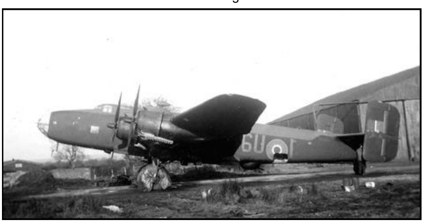
A Halifax III of No 415 Sqn RCAF at RAF East Moor in 1944.

The last Canadian squadron to use the airfield was No 415 Squadron which flew the Halifax III from 26 July 1944. The unit inherited the additional Mk VII versions during March 1945 but disbanded shortly after on 15 May 1945 at the airfield. After the end of the war in Europe, RAF East Moor was taken over by the RAF for a short while before being closed in late 1946. However, the memorial at Sutton on the Forest ensures that the sacrifices made by RAF and RCAF personnel which flew from RAF East Moor will not be forgotten.