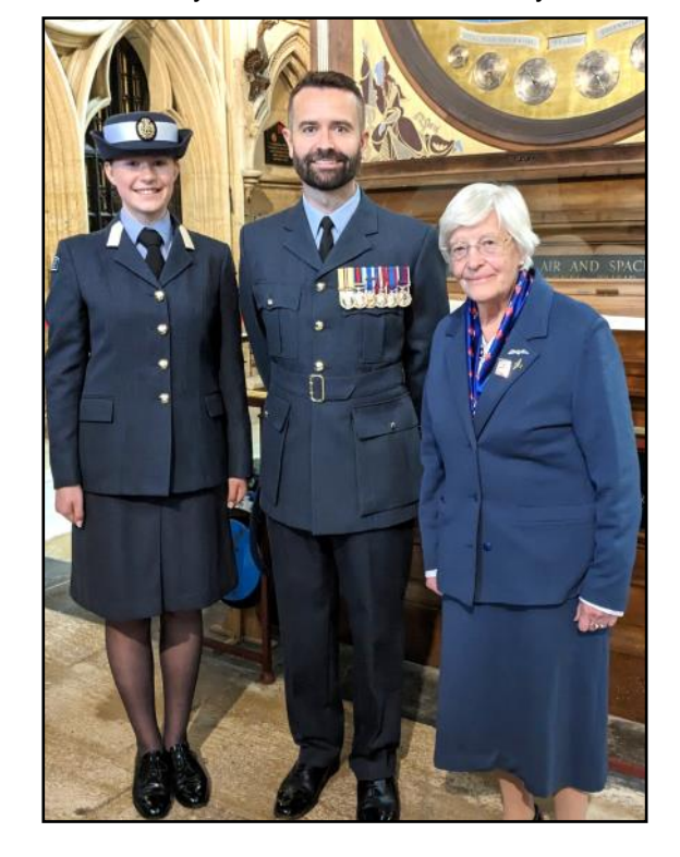
The three page turners in front of the Minster Astral Clock.