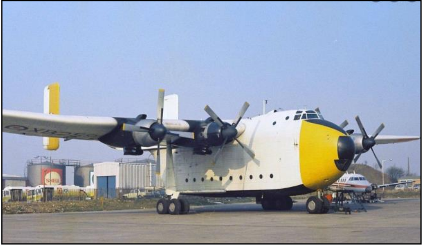
Beverley survivor XB259 in Court Line service in 1974.

collection had to move. XL149 was considered too big to move (it was not airworthy) and so it was cut up.