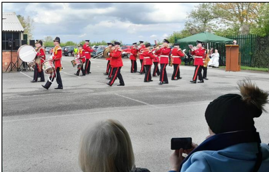
The Band of the Yorkshire Volunteers at the ELMS Service at Eden Camp.