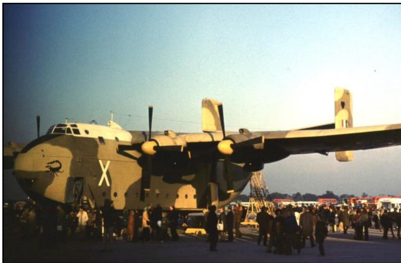
Beverley XL149 on static display at RAF Finningley in September 1974.

The February 2021 edition of the Aldwark Chronicle included an illustrated article on the last surviving Blackburn Beverley transport aircraft, number XB259, whose future was very uncertain. and it was still languishing at Fort Paull, near Hull, with its four piston engines removed.