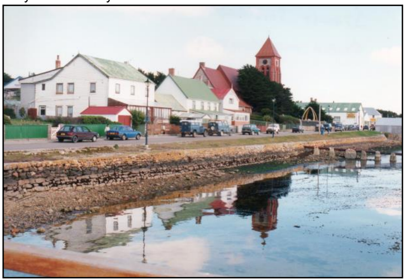
Port Stanley waterfront in 1997.

For my efforts whilst on detachment, I was very fortunate to be invited by the Governor to a reception in Government House to celebrate the Queen's birthday as a "thank you."