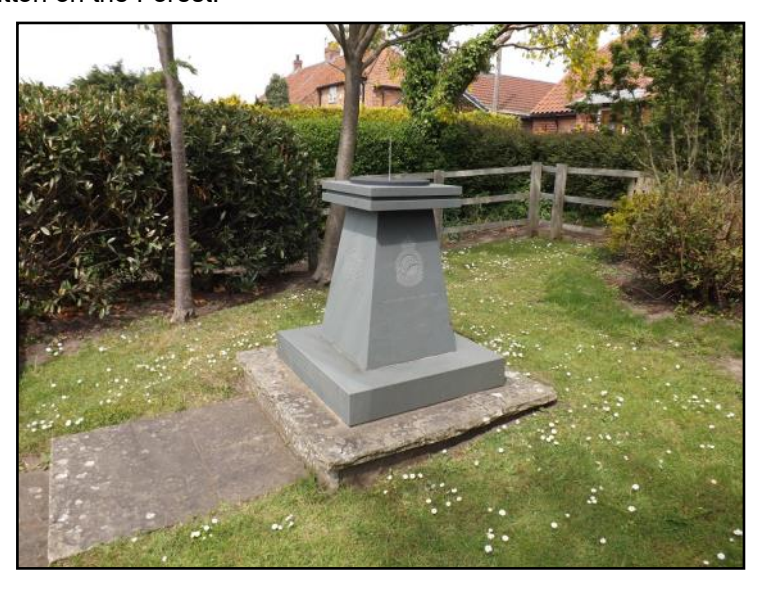
The RAF East Moor memorial sundial at Sutton on the Forest

The last time this memorial service was held at the Royal Canadian Air Force Memorial at Sutton on the Forest was in May 2019, due to COVID-19 restrictions. It was, therefore, very pleasing for some members of RAFA York Branch to be able once more to attend this short, but significant service of remembrance at the RAF Eastmoor memorial which is in the nearby village of Sutton on the Forest.