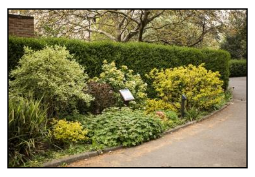
The Memorial Plaque