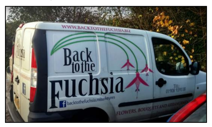
A florist's pun!