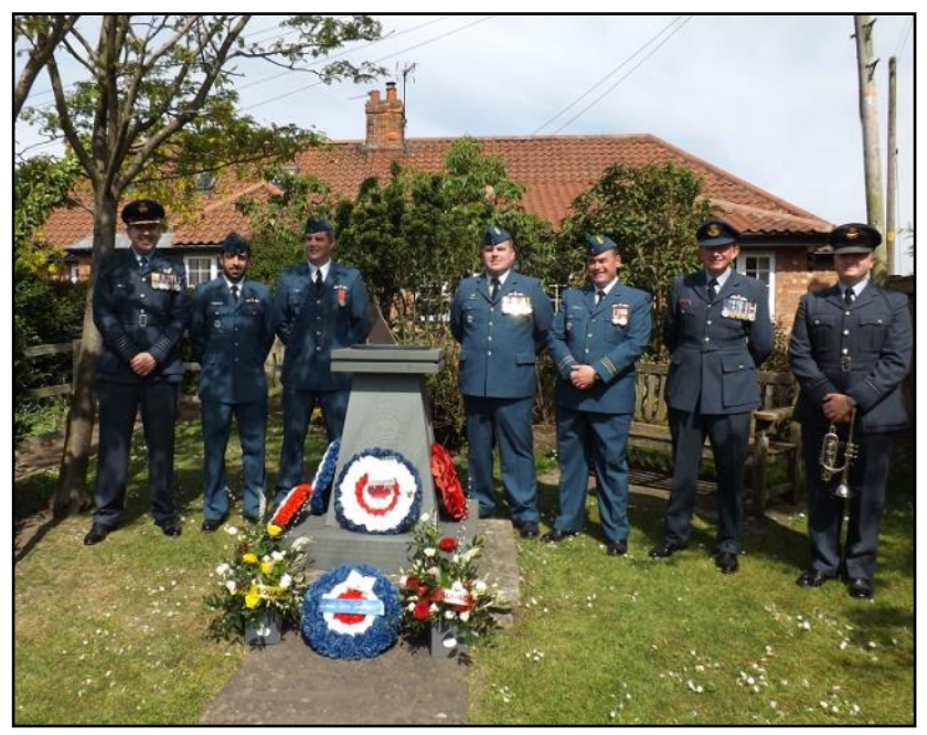
Service personnel from Canada and the UK at the memorial.

Halifax II bombers. In November 1942, the station was handed over to the RCAF, and No. 429 Squadron RCAF formed at the airfield on 7 November 1942 initially only flying the Vickers Wellington Mk III until January 1943 when the Wellington Mk. X was added. On 19 September 1943 the next squadron arrived being 432 Squadron which initially used the Avro Lancaster Mk II before being re-equipped with the Halifax Mk III in February 1944 and the Mk. VII Halifax in July 1944. The squadron disbanded on 15 May 1945 at the airfield.