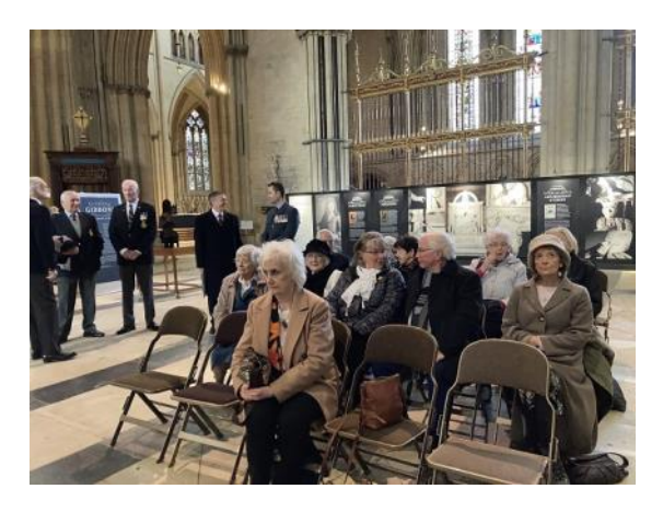
Members and guests prior to the Ceremony.