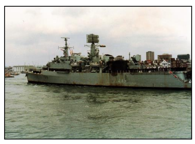
HMS Glamorgan (with battle damage) returns to Portsmouth on 10 July 1982.

I never served in the Falklands Campaign, nor had a tour of duty there during my time in the Services. However, I do have clear memories of the aftermath of the conflict, as I was based at HMS Sultan (Gosport) at the time. I saw several of the Task Force ships depart and most of them return.