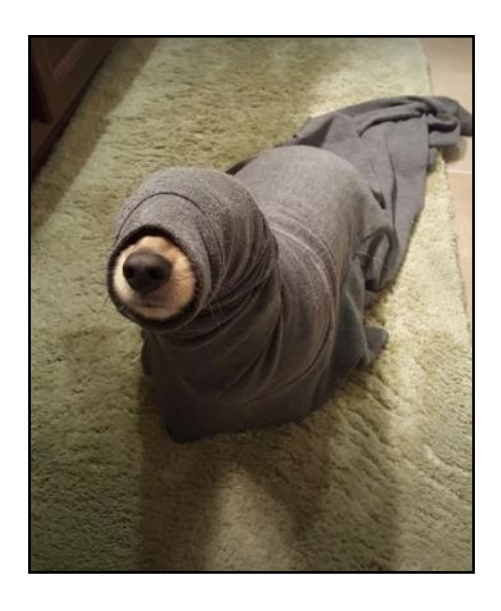
"Oh no! There's a seal loose in the bathroom!"