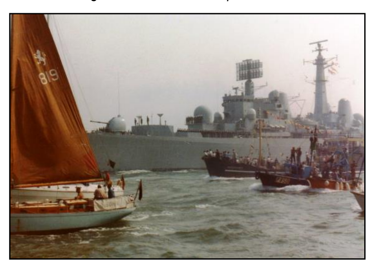
HMS Bristol arriving Portsmouth on 17 September 1982..

I will publish some material from a couple of our members who actually served "Down South" in the next edition all being well.