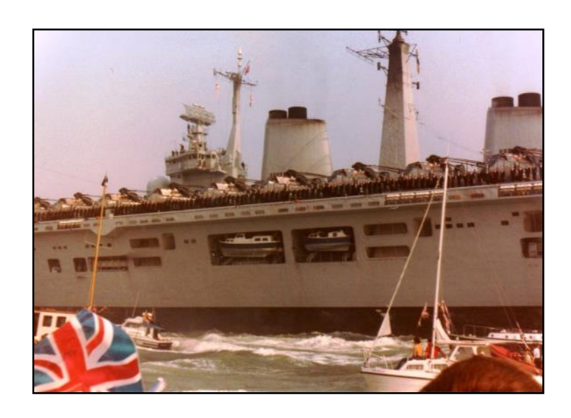
HMS Invincible arriving Portsmouth on 17 September 1982.