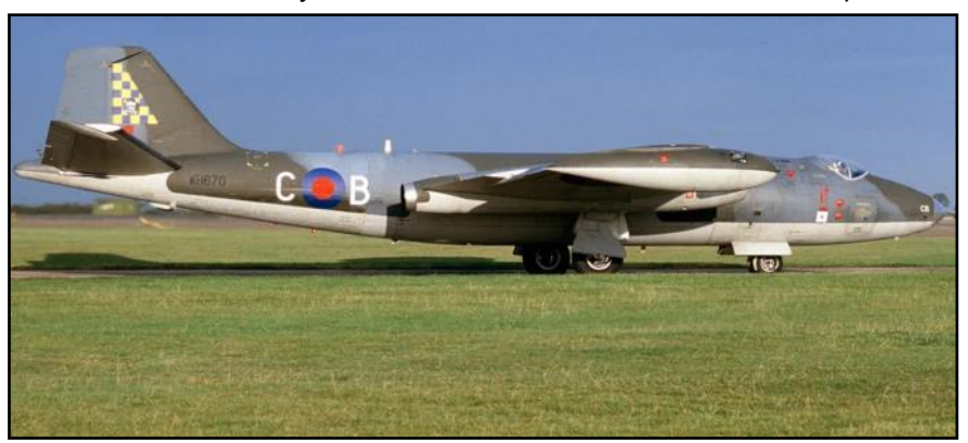
Canberra B2 of No 100 Sqn at RAF Wyton in October 1986.

Between 1946 and 1950 the squadron was based at RAF Hemswell operating Avro Lancasters and later Avro Lincolns. The squadron left Hemswell in 1950, relocating to Malaysia where it was involved with Operations Firedog and Musgrave. In January 1954, the unit deployed to Eastleigh in Kenya during the Mau Mau Uprising. Returning two months later, the squadron was re-equipped with English Electric Canberras, moving to Wittering in Cambridgeshire. It was disbanded on 1 September 1959, but re-formed at Wittering on 1 May 1962, equipped with Handley Page Victor B.2s, which, from early 1964, carried the Blue Steel nuclear weapon.