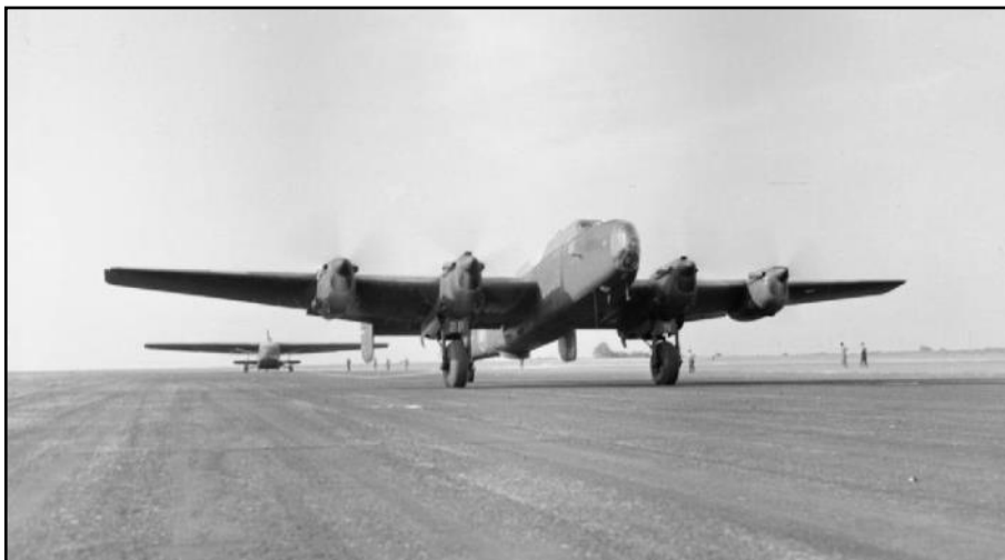
Merlin-engine Halifax MkV 1A LL218 of No 644 Sqn at RAF Tarrant Rushton with a Hamilcar glider in tow, prior to take-off.